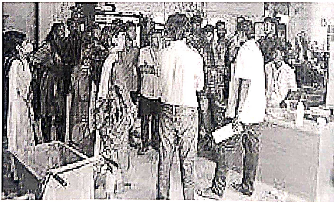
Internship program in Civil Engineering department