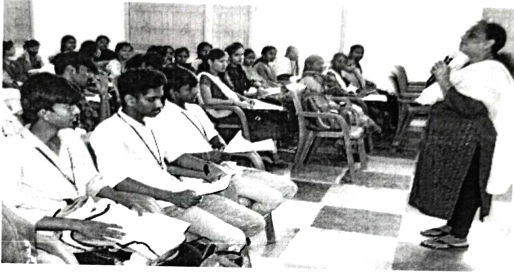
Seminar on "Parts of Startup Ecosystem in India" dated 07-09-2018.

Approved by AICTE New Delhi & Affiliated to Anna University, Chennai (A Jeebu Minorities Institution)